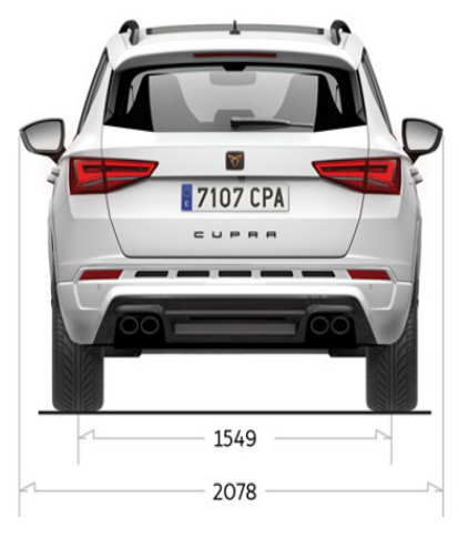
CUPRA ATECA Dimensions