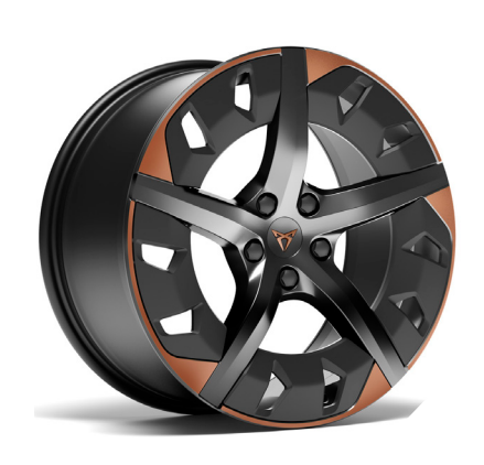
19IN AERO MACHINED SPORT BLACK / COPPER (P9C) ■