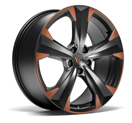
19IN MACHINED SPORT BLACK / COPPER (P8A) ■