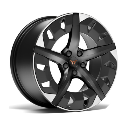
19IN AERO MACHINED SPORT BLACK / SILVER (P8V) ■