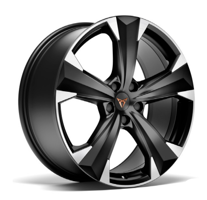
19IN MACHINED SPORT BLACK / SILVER ■