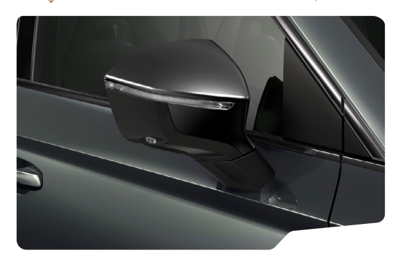
↓ GRAPHITE GREY - 5X5X (Metallic)