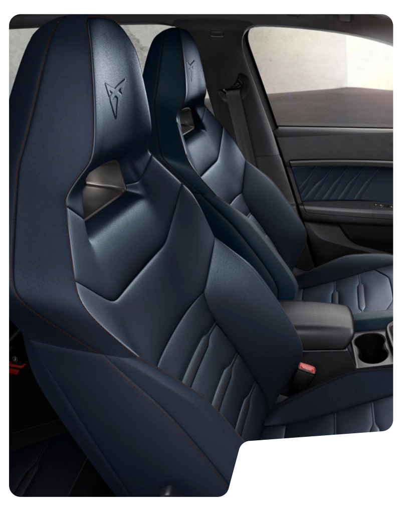
\downarrow PETROL BLUE LEATHER INTERIOR lacktriangle