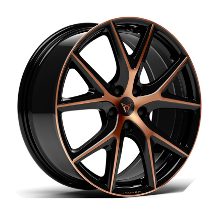
19IN MACHINED R SPORT BLACK / COPPER (PYA) ■