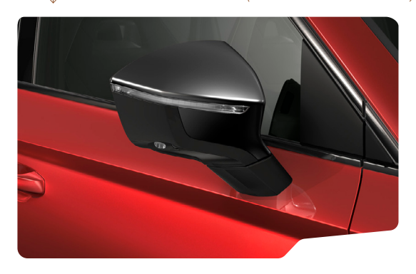
↓ MAGIC BLACK - 1Z1Z (Metallic)