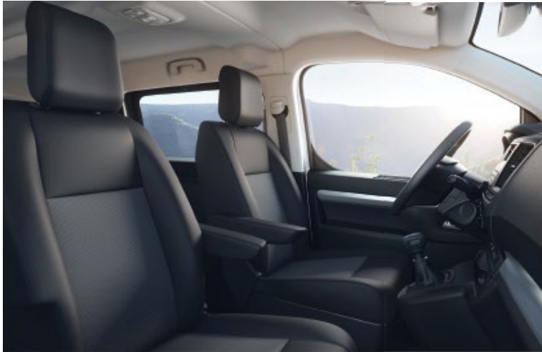
Tritone Grey fabric interior trim.