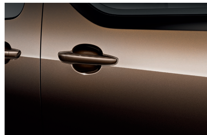
Rich Oak Brown