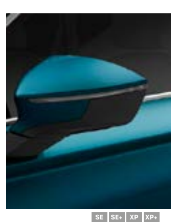
Lava Blue OFOF - Metallic