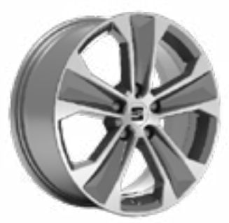
DYNAMIC 17" ALLOY WHEELS SE+