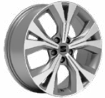
PERFORMANCE 18" ALLOY WHEELS XP+