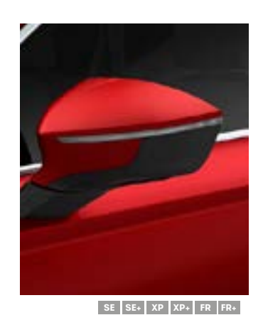
Velvet Red K1K1 - Premium Metallic