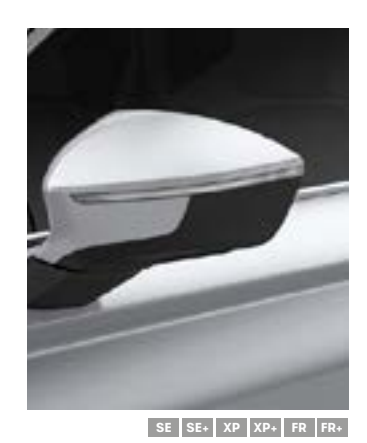
Nevada White 2Y2Y - Metallic