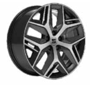
EXCLUSIVE 19" ALLOY WHEELS FR FR+