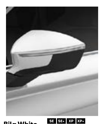
Bila White 9P9P - Soft