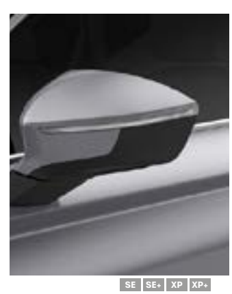
Brilliant Silver 8E8E - Metallic