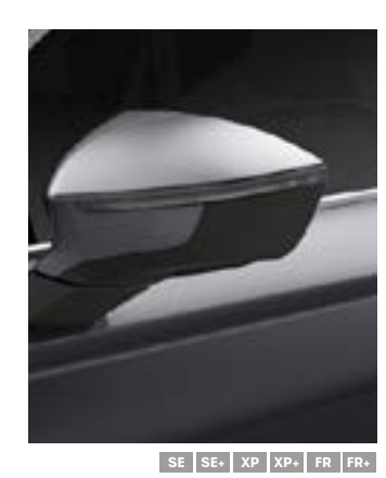
Graphite Grey 5X5X - Metallic