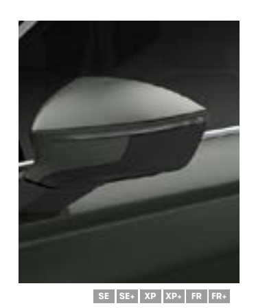
Dark Camouflage 9S9S - Premium Metallic