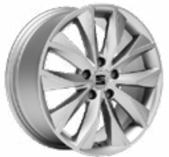
DYNAMIC 17" ALLOY WHEELS SE