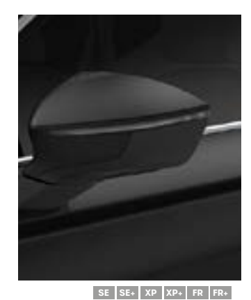
Magic Black 1Z1Z - Metallic