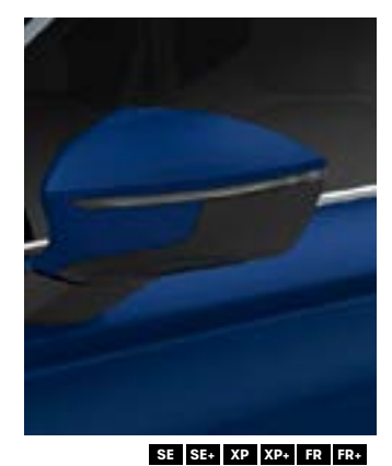
Energy Blue K4K4 - Soft