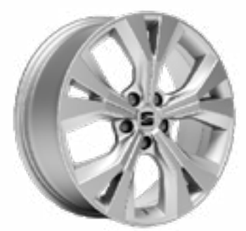
PERFORMANCE 18" ALLOY WHEELS XP