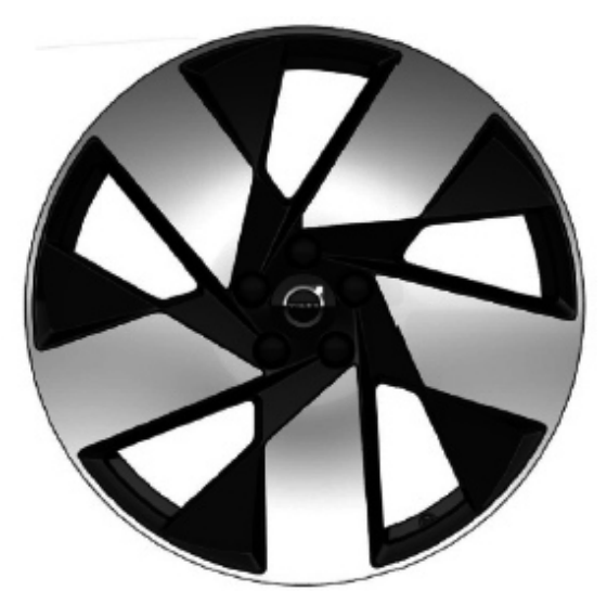
20" 5 Spoke (#1185) Std Ultimate