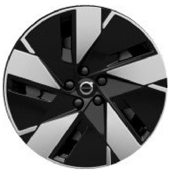
19" 5 Spoke (std Core and Plus)