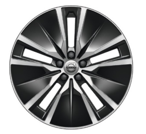
19" 5 Double Spoke Black Diamond Cut Alloy Wheel (std Core)