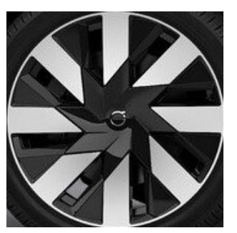
21"8 Spoke Black Diamond Cut Alloy Wheel (#1254)(Standard Ultimate, Optional Plus )

20" 5 Spoke Black Diamond Cut Alloy Wheel (#1094)(Standard Plus Dark)